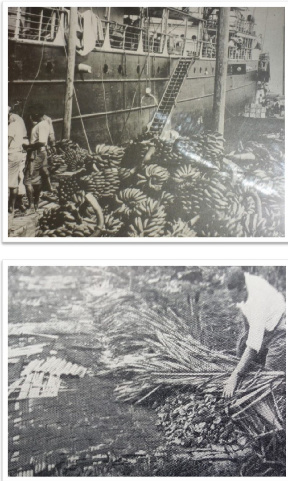
Figure 1.1 Postharvest handling and export of selected crops. (Top) bananas for export in 1990s, (bottom) sun-drying copra on primitive bamboo - pictures sourced from J.W McPaul, 1963.