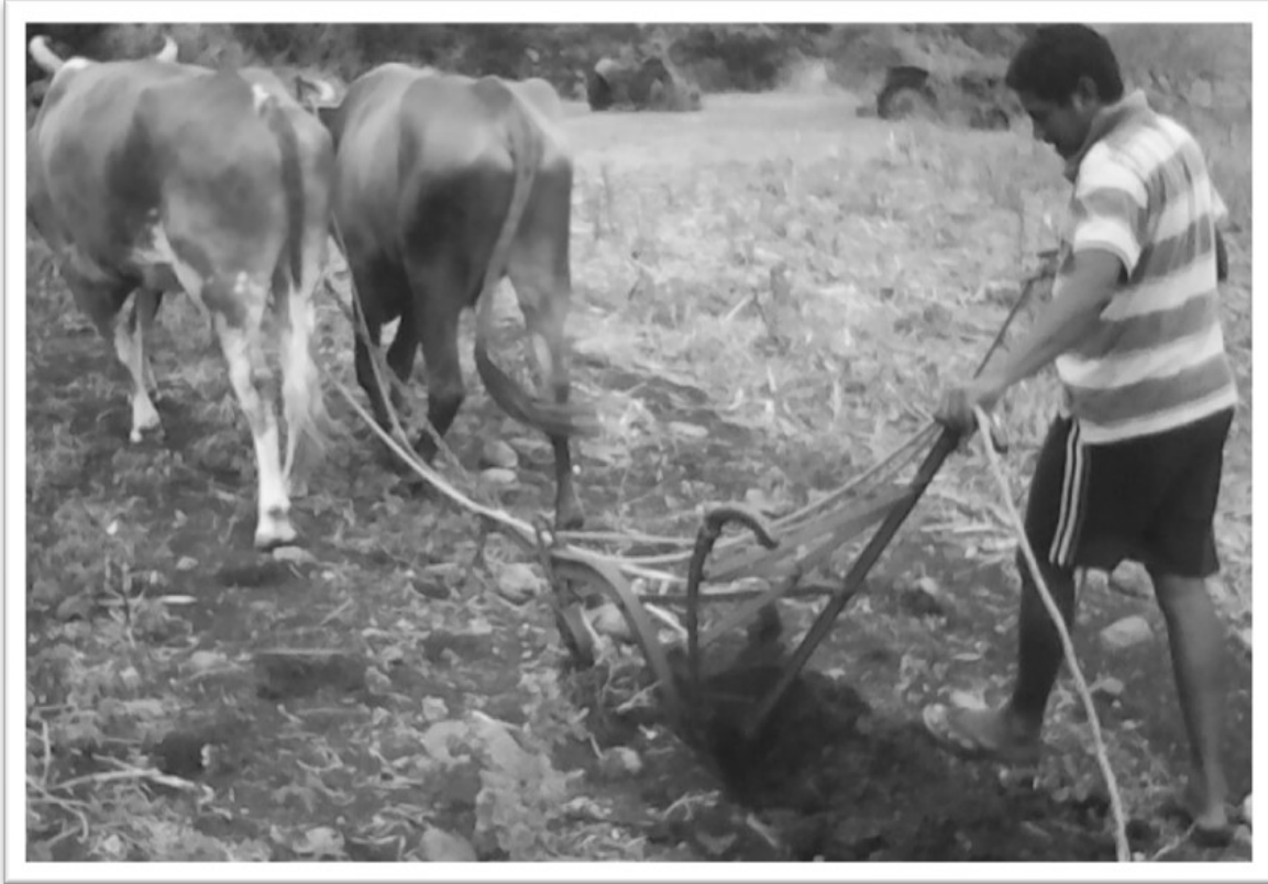
Figure 1.2b The use of working bullocks is prevalent with smallholder farming system in Fiji.

The late 1980s was marked by wide fluctuations in agricultural output due to adverse weather, political upheavals and resultant emigration of skilled labour (Kasper et al., 1988; Jayaraman, 1996). The foreign aid was immediately removed in response to the political upheaval, which impeded implementation of remaining capital projects as per DP9. In addition, during the late 1980s the government moved towards an export oriented strategy for development and withdrew its support for agriculture (Prasad & Narayan 2005). By the 1990s most import licences were removed. In view of deregulation and removal of licensing and quotas, the current trade policy regime is fairly liberal with generally low tariffs on food and agriculture products. However, a satisfactory resolution to security of tenure in agricultural land leasehold was still seen as paramount to economic reforms (Jayaraman, 1996).